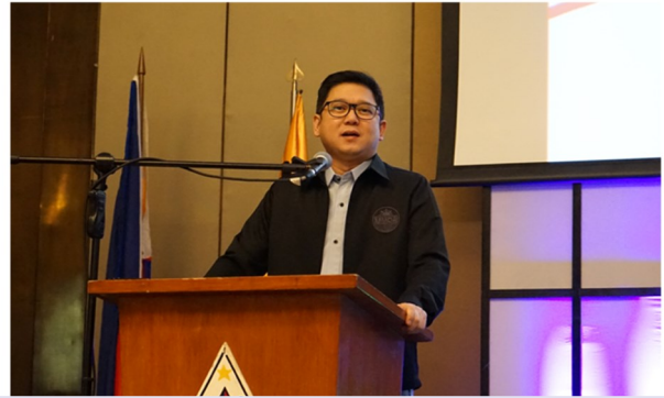
Hon. Mayor Herbert M. Bautista delivering his speech during the 2018 National Conference of Librarians at Novotel Hotel, Araneta, Cubao, Quezon City

There were more or less five hundred (500) participants that came from the 18 regions of the country, with Quezon City the highest number of 36 participants, followed by Central Luzon and Calabarzon with 26 participants each.