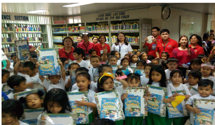
Pupils of Yakap Day Care Center showing their received Smart books with District V library personnel at the back