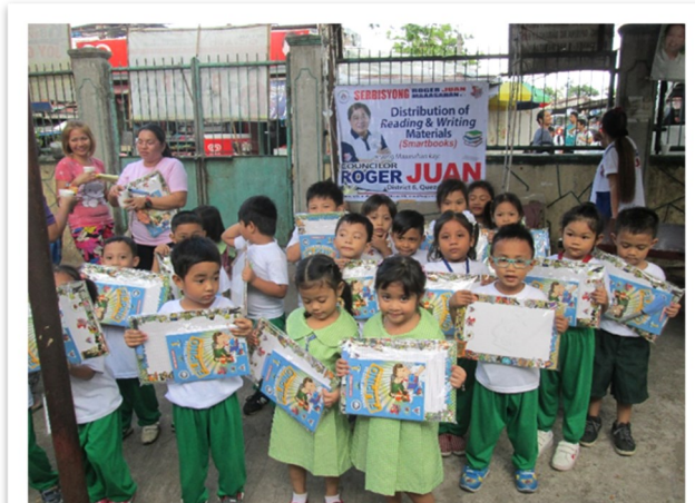
Yakap Day Care pupils received Smart books