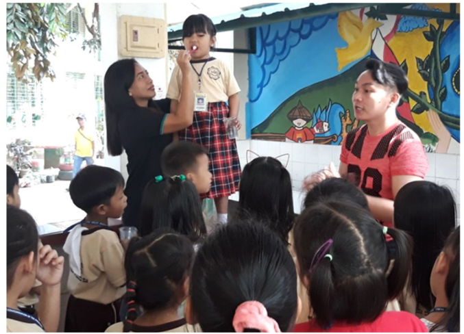
Demonstration of the actual proper brushing of teeth