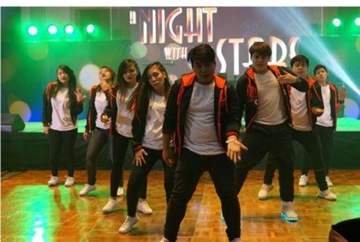
Selected QCPL staff rendering a modern dance number