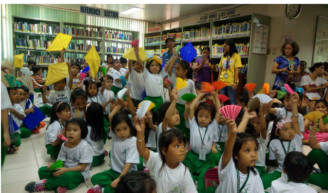
Kinder 1 Yakap Day Care kids showing their finished Origami