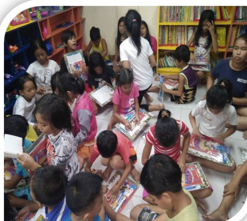
Smart books were distributed to the kids after the activity.