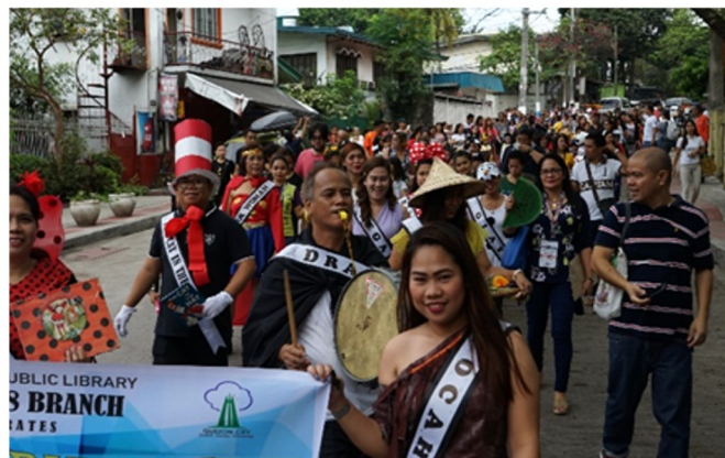
Book character parade participants on the street showing off their character costumes with QCPL Project 8 branch library staff in the front line.