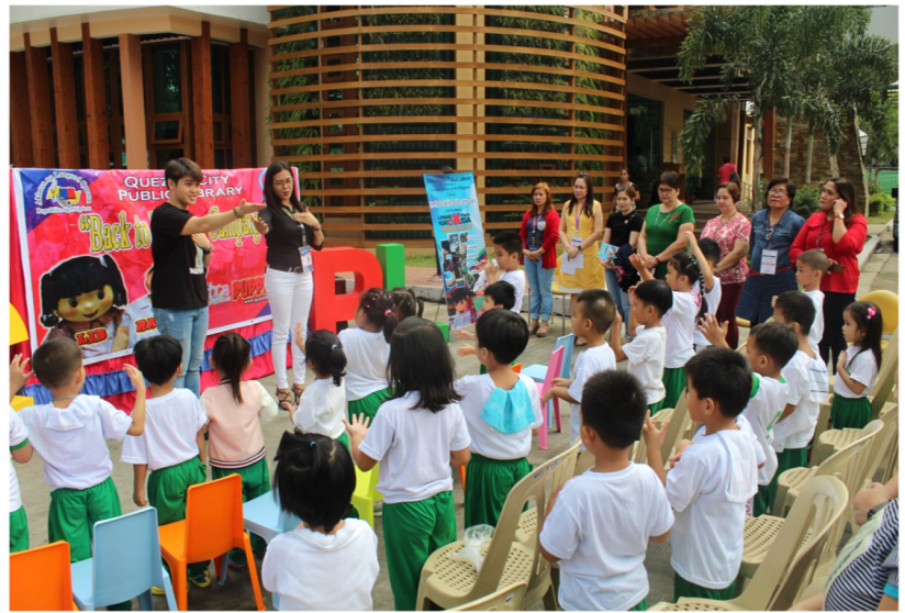
At the QCPL parking lot with the kids of Yakap Day Care Center during the Public Library day doing a song invocation at the start of the program.