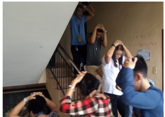
During earthquake drill at QCPL Novaliches Branch Library, from the 3 rd floor down to the 1 st .