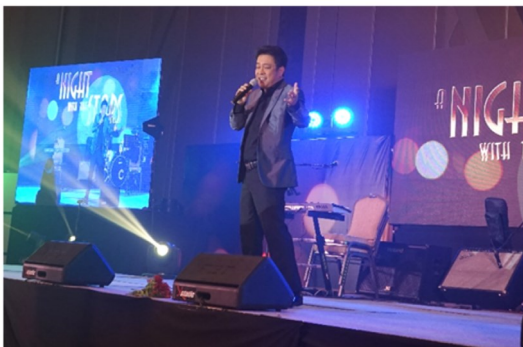
Mr. Hajji Alejandro, serenading the librarians/participants