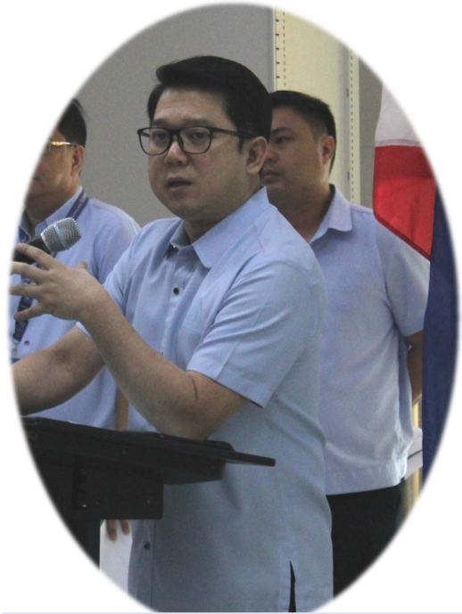
Hon. Mayor Herbert M. Bautista delivering his speech on the launching of innovative services at the QCPL Readers area.

Mayor Herbert Bautista in his talk commented on the label as the “Father of the 21 st century library”.